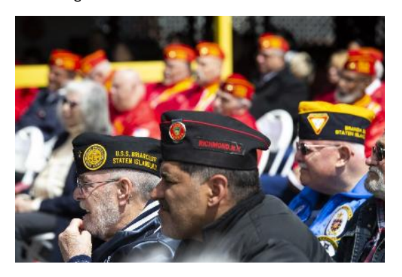
Just a few of the veteran groups that were represented that day.