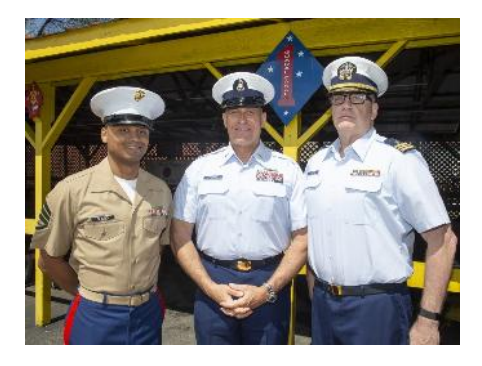
The Marines, the Coast Guard and the Navy were present