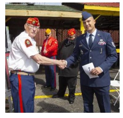
And the Air force too