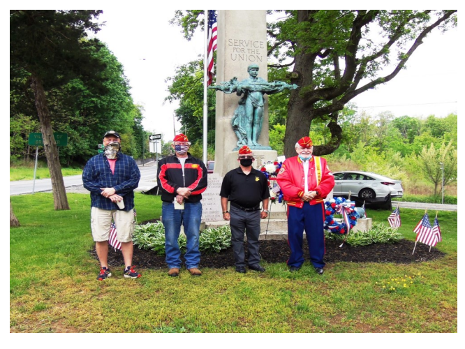
(Left and right)